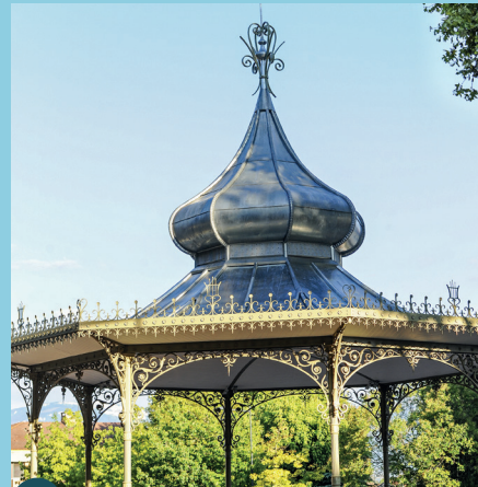
3 The Bandstand (“Kiosque”)

A symbol of the city since the Middle Ages, this tower features a clock and an automaton that has long marked the rhythm of daily life. It once served as a prison gate and later as a public clock.