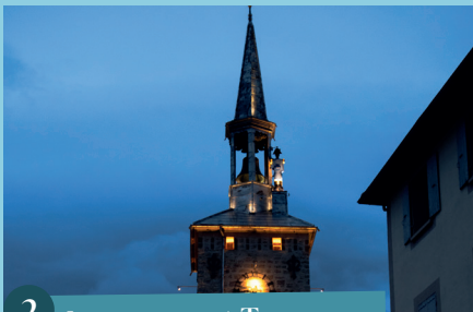
2 Jacquemart Tower

Founded in 838 by Saint-Barnard, this Benedictine abbey is the birthplace of Romans. Blending Romanesque and Gothic styles, it houses a remarkable treasure : nine embroidered tapestries depicting the Passion of Christ (on view during the season and guided tour).