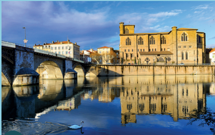
1 The Collegiate Church of Saint-Barnard

Famous for its boutiques and unique craftsmanship, Romans offers much more than just a charming setting. Discover its rich heritage and iconic landmarks, all located in and around the historic city center.