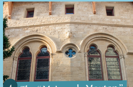
4 The “Maison du Mouton”

Erected in 1888 on Place Jules Nadi, this venue for concerts and cultural events was restored in 2018. It remains a vibrant, welcoming space in the heart of Romans.